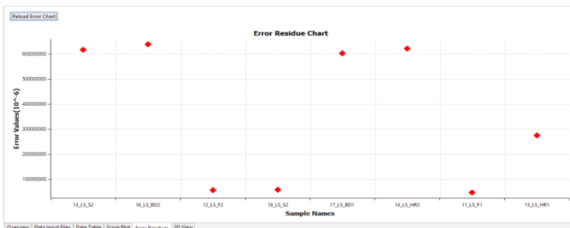
Figure 2: The residual error of PCA model for determination of optimum principle components used in PCA model.