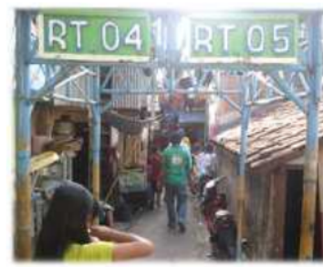
Fig. 5. High tension brawl place