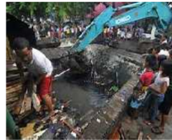
Fig. 8. Living environment in Johar Baru Sub-district