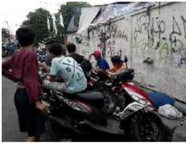
Fig. 3. Kepar Gank Tanah Tinggi Urban Village