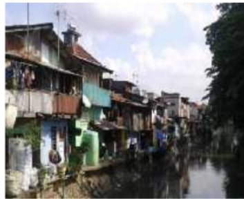
Fig. 7. Living environment in Johar Baru Sub-district