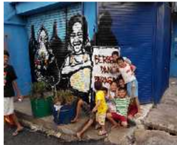
Fig. 4. Hanging out habit start from kids