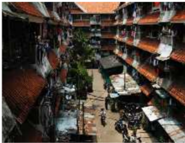
Fig. 6. Row Housing in Tanah Tinggi Urban Village