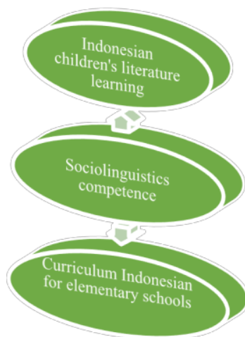
Figure 4 Indications of sociolinguistics competence

It turns out that no learning process emphasizes grammatical competence, but the scope of each category has a section that emphasizes grammatical ability. Each category in communicative competence achievement has a learning experience that supports achieving goals. The learning experience materials indicate communicative competence in the learning plan.