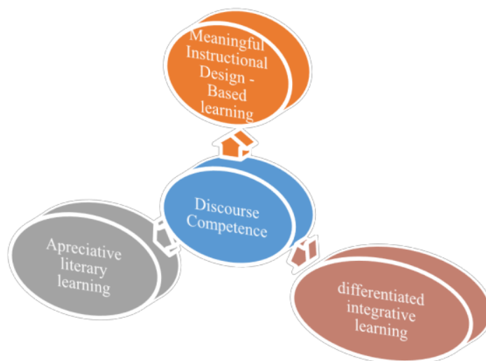
Figure 3 Indications of discourse competence