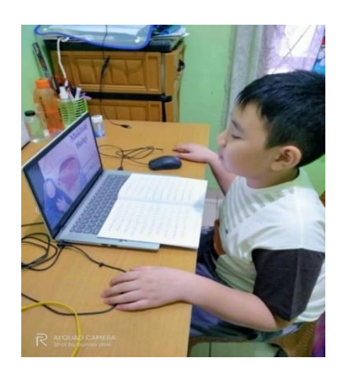
Figure 2 Learners watch learning videos through the YouTube channel

WhatsApp Messenger is used as a medium to convey information to parents of students related to lesson schedules, collection of assignments, and other information related to the online learning process and student administration. In addition, WhatsApp Messenger is also used by teachers to video calls with students make associated with memorizing letters while students carry out online learning.