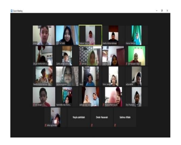
Figure 1 Learning via Zoom

In addition to using Zoom, online learning at SDIT Al-Fatih also uses learning videos made by teachers and uploaded to the SDIT Al-Fatih Youtube Channel. The maximum length of the uploaded learning video is 10-15 minutes. The teachers needed time flexibility to minimize the possibility of students feeling bored and stopping watching the video before presentation ended. Just like learning through Zoom, learning through YouTube also has advantages and disadvantages. The benefits of learning using videos may drive the teacher to be creative and improve technical skills, such as editing learning videos with various engaging media such as music and pictures that match the material taught. Online learning that uses digital media at the primary and secondary education levels is more inclined to change the image of education because