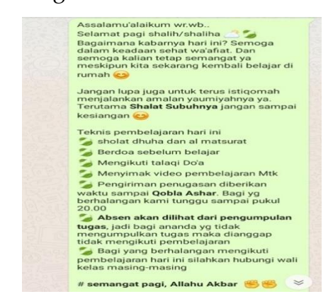
Figure 9 The teacher provides motivation and a daily activity schedule through the WhatsApp group.

parents can prepare students learning well.