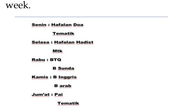
Figure 8 Class IV Schedule for the first week of March

students' use of gadgets or devices. The fourth-grade teacher of SDIT Al-Fatih carries out communication with parents on an ongoing basis through class groups created on the WhatsApp Messenger application. The group's functions include conveying information related learning to schedules and technicalities, collecting assignments, and other information related to the learning process—online offline, well student and as administration. The lesson schedule is distributed to parents through the WhatsApp group a day before the lesson, including a schedule for the next