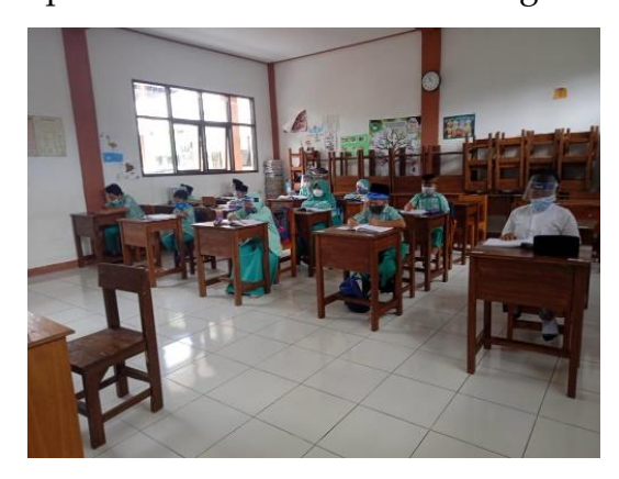
Figure 11 Seating arrangements for class IV Saad students

addition, clean and sterile classrooms and seating arrangements considered must be implementation of offline learning.