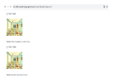
Figure 5 The front page of the Gnomeo online study room Class IV SDIT Al-Fatih Cigombong

Online assessments for test week, mid-semester assessments, end-ofsemester assessments, and year-end assessments were carried out through Google Forms and Gnomeo. First, the teacher makes a test question on the Google Forms page; then, students will get a link to fill in the questions according the specified hour. to Gnomeo is a site that provides elearning facilities based on an LMS (Learning Management System), where teachers can create and check questions and enter students into the online learning room using the username and password given to each learners.