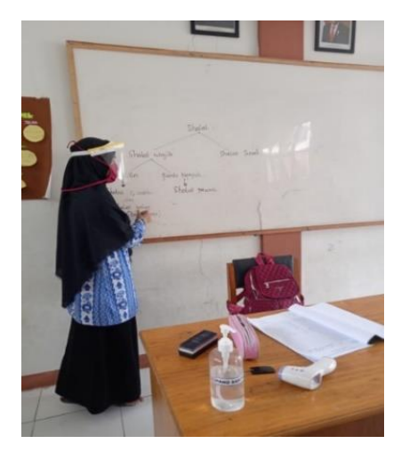
Figure 7. Delivery of learning materials offline in class IV

teacher without being constrained by signals or inadequate internet access in their homes.