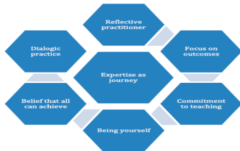
Fig. 1. Professional teachers [3].

Professional teachers are those that advanced professional practice is best described through the notion of 'a teacher with expertise' and that this is preferable to the term 'the expert teacher' [3].