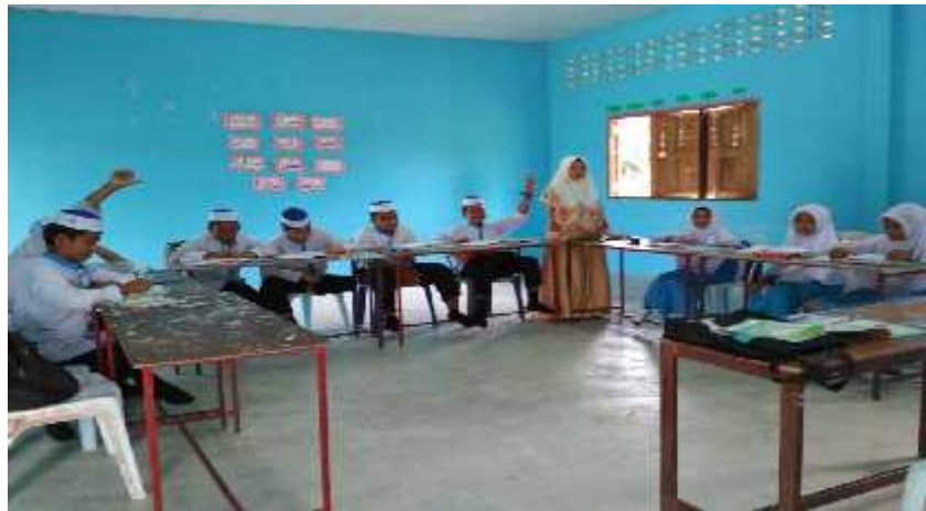
Figure 2. Seat Position is Based on Students' Height

The students' uniforms gave behavioral aspects to organizing the classroom. There was different type of uniforms based on gender. The uniform policy gives a setup to all of the students in an excellent manner. Behavioral classroom management is how to deal with the students during the teaching-learning process, which is carried out in two steps, namely: (1) preventive actions and (2) corrective actions (T. Mulyani, 2001).