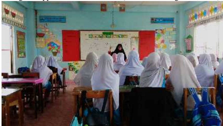
Figure 3. Classroom Notes for Teacher and Students on the Wall

The class has a list of what the teacher can do and what the teacher cannot do. Figure 3 describes a list in front of the class, reminding the teacher and the students of specific goals and activities. Furthermore, the teacher created a lesson plan to guide her/him for only doing the activities listed. Then there is no maltreatment. Also, the teacher asks students to express things they do not like about the teaching method and what they like to do. The recipe can be interpreted from a teacher's perspective, which assumes that the class can be managed well through the making and application of class rules (Jerome Freiberg et al., 2020)