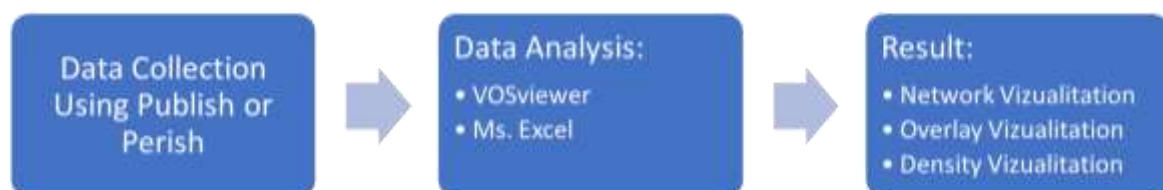
Figure 1. Data Analysis Process

Data analysis with bibliometric analysis approach was carried out using VOSviewer to see three things, namely Network, Overlay, and Density Visualization. In addition, to see research trends, a mapping of the research number using Ms. Excel (Suherman, et. al, 2023; Fauziah, et. al, 2023). The description of the data analysis of the research is as follows (see figure 1):