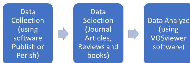
Figure 1. Bibliometric research procedures

This research uses bibliometric analysis and visualization. Bibliometric analysis is a descriptive bibliometric that characterizes the characteristics of literary works. The sample used was 995 publications from the Scopus database using Publish or Perish software and the keywords "language", "science" and "learning". The research data collection period is from 2019-2023 and publications are in the form of journal articles, reviews, and books. The collected journal article documents are not directly used for visualization analysis with VOSviewer but are selected through selection with the criteria that the articles have important identifiers. Once the data meets requirements, it is then analyzed using VOSviewer. Detailed information regarding bibliometrics can be found in previous literature (Al Husaeni and Nandiyanto, 2022; Azizah et al., 2021) (see figure 1).